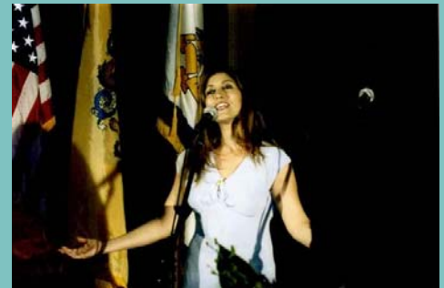
Laleh: Singer/Songwriter and re- cipient of the 2004 IIFWP Amba- sador for Peace Award